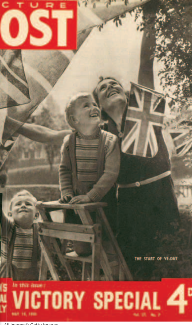
All images © Getty Images