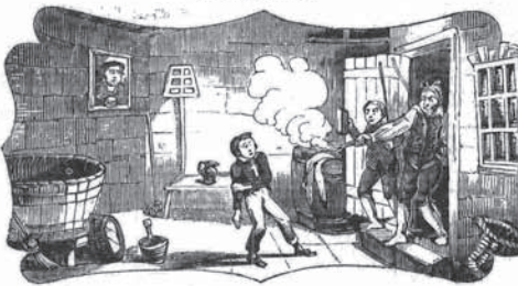
From Cleave's Gazette of Variety (London, England), December 8, 1838 in 19th Century UK Periodicals .

plying with this request must be regarded as abundantly satisfactory:—