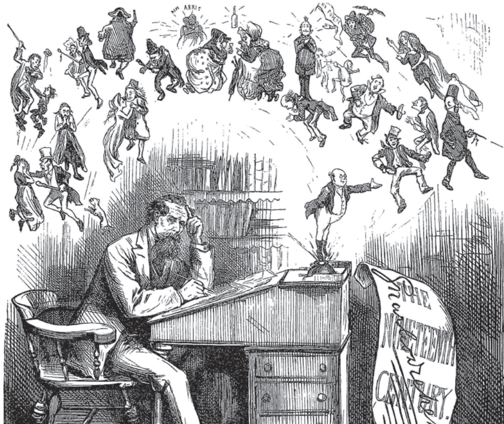
From Fun (London, England), June 25, 1870 in 19th Century UK Periodicals .

"Among other serious symptoms he noticed that he could read only the halves of the letters over the shop doors on his street. The old electricity was treated