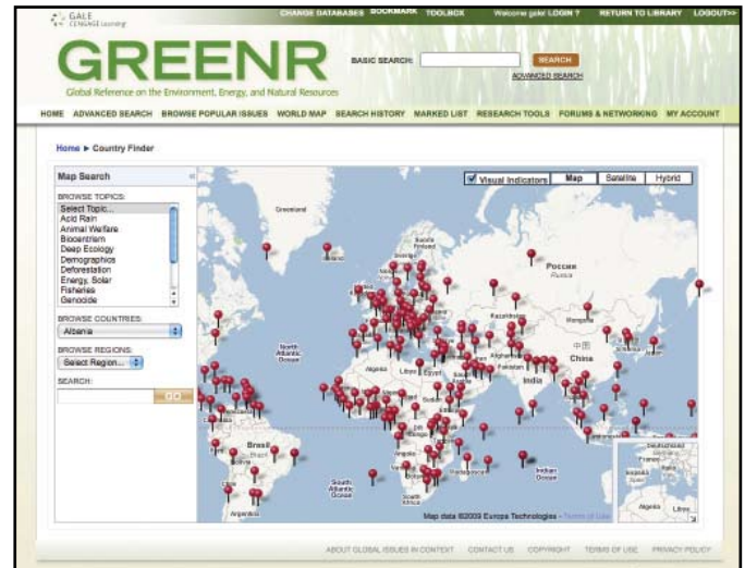
▲ Google Map technology lets students connect environmental issues with global points of view