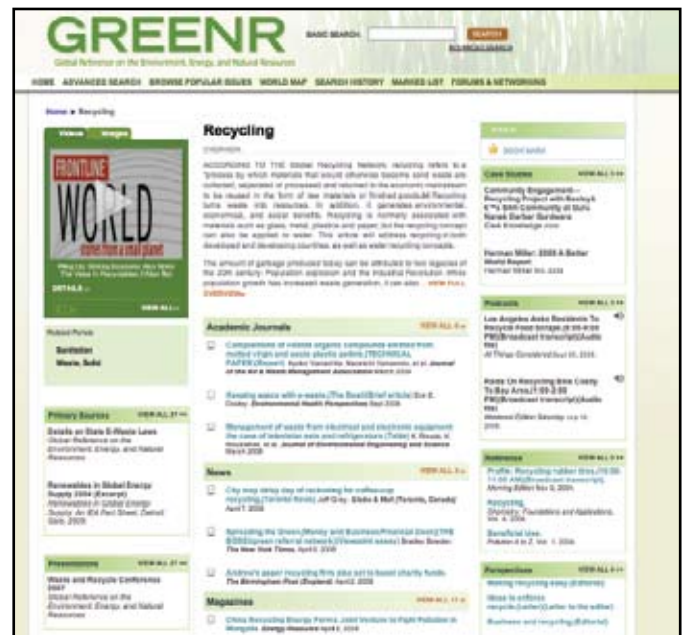
▲ Overviews, videos, case studies and more bring complicated topics into focus