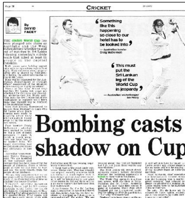
'Bombing casts shadow on cup', The Daily Mail , 1 February 1996; pg. 76

Details: The Sunday Times , 21 January 1996; pg. 11