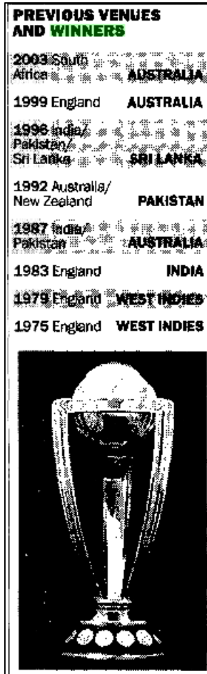
'ICC Cricket World Cup 2007', The Times, 6 January 2007; pg. 12