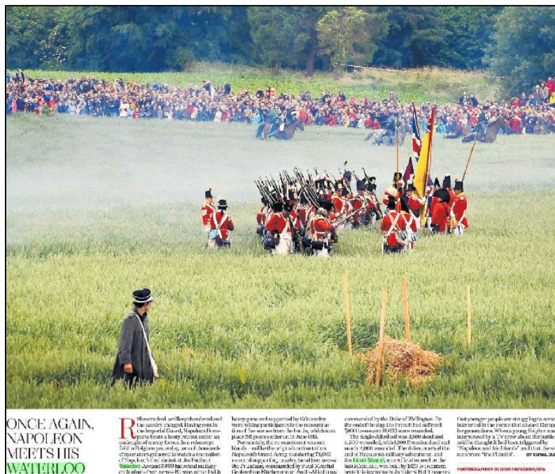
'Once again, Napoleon Meets his Waterloo', The Independent , 21 June 2010; pg. 27

Title: WATERLOO RE-FOUGHT – IN SCOTLAND Details: The Illustrated London News , 3 November 1934; pg. 711