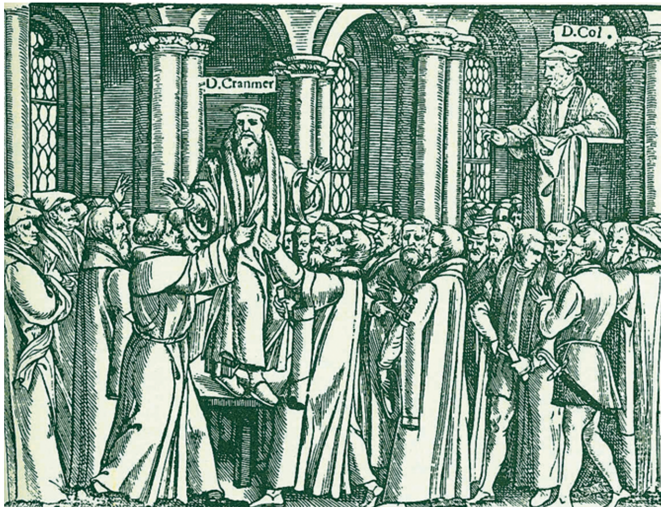
Illustration (below): Thomas Cranmer and Henry Cole, Dean of Saint Paul's, from John Foxe's Book of Martyrs.