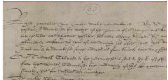
Death of William of Orange: SP 83/22 f59