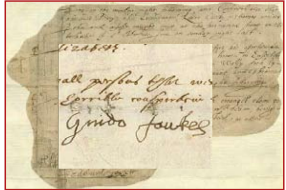
Guy Fawkes' Confession, 1605